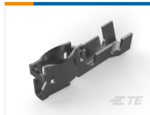
TE Part # 141101-2 RECEIPT CLUSTER