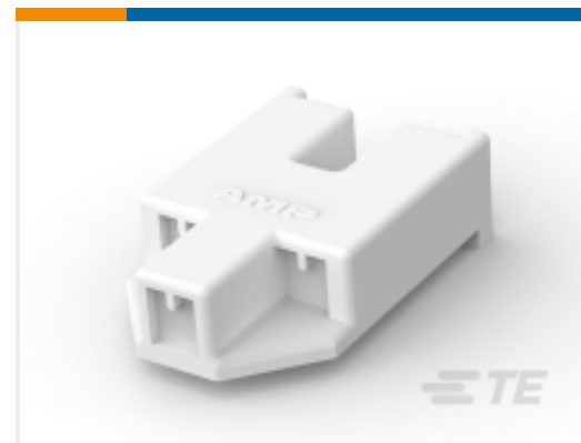
TE Part # 360033-1 090 DIA CLSTR BLK