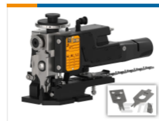
TE Part # 7-2150942-2 OCEAN_2.0_Applicator-E-070F130F