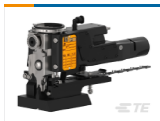
TE Part # 2-2150942-2 OCEAN_2.0_Applicator-E-070F130F