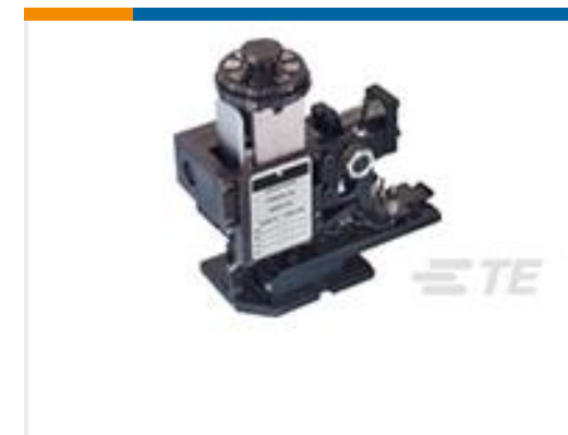
TE Part # 1855603-1 HDM/FA EAPR.070F.130F LM/BENCH G CUT