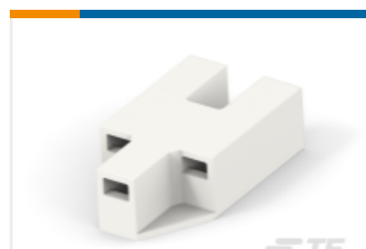
TE Part # 737110-3 CLUSTER BLOCK HSG VO WHI