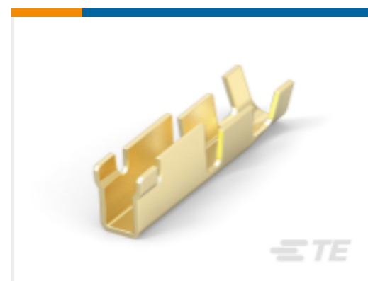
TE Part # 62131-8 CLSTR PIN RCPT