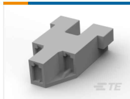
TE Part # 171370-5 CLUSTER BLOCK HSG PBT