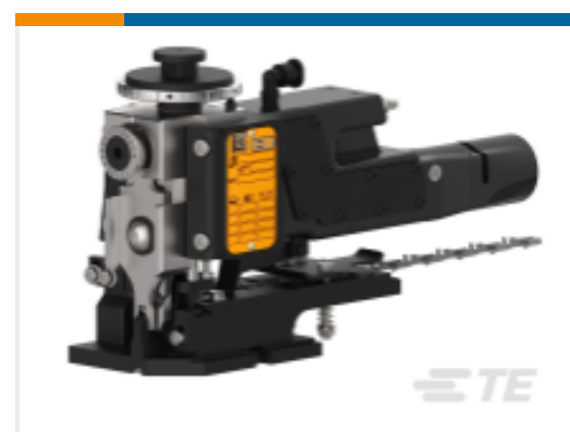
TE Part # 2150942-2 OCEAN_2.0_Applicator-E-070F130F